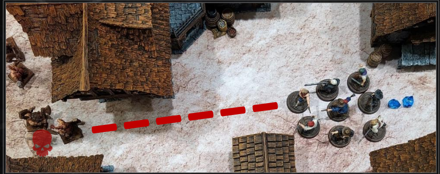
The Unit makes its second Action: 'Attack'