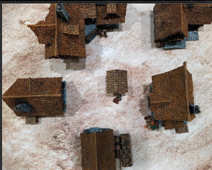
This is a decorated board to act as the Battlefield

Set up a Battlefield to play on. We recommend a flat, rectangular or square surface, but you can use anything and almost any size. Place some scenery on the Battlefield. Divide the board to suit the number of players, with a neutral 'no man's land' in the middle. For example, divide the board into 3 areas for a two-player game. Player areas are called Deployment Zones.