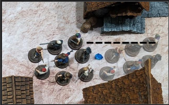
The Unit makes its first Action: 'Move'