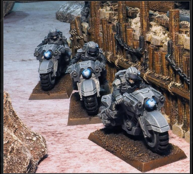
Models by Puppetswar , Gaming Mat by Deep-Cut Studio .