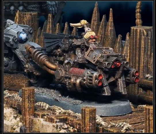
Model by Wargame Exclusive , Ramparts by Printable Scenery .

Wipeout: If reduced to 0 HP from Weapons or struck with a Mini Nuke, the Racer will suffer Wipeout. When this occurs, the Racer cannot Dash or Move until after the next Attack Phase and loses all its Gems. At the start of the next Attack Phase, the Racer restores all its HP. Wipeout counts as a Casualty for some Perks. Wipeout removes all Afflictions and Perk effects.